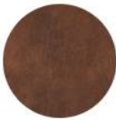
PREMIUM FABRIC: BISON (VINYL)