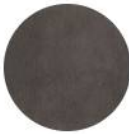
PREMIUM FABRIC: SLATE (VINYL)