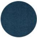
PREMIUM FABRIC: ROYAL