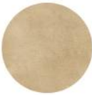
PREMIUM FABRIC: SAND (VINYL)