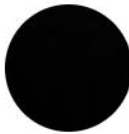
PREMIUM FABRIC: NOIR