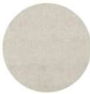
PREMIUM FABRIC: MIST